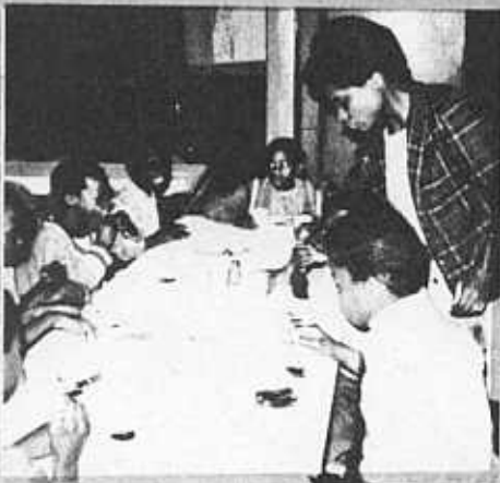
Whatever we do is to serve the People