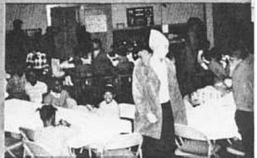
Sisters on their job