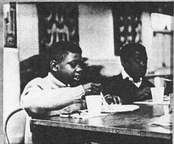
Grits, eggs and bacon is what's happening