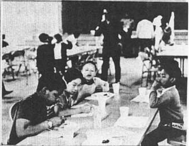
Free breakfast is for all children