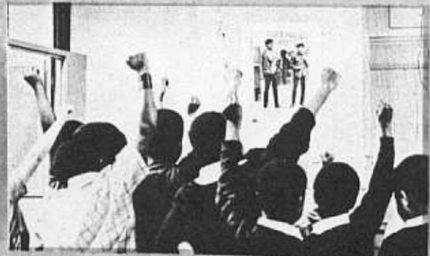
and Bobby Seale and the Panthers