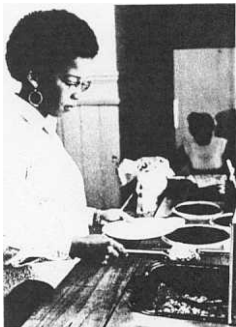
All party work is political